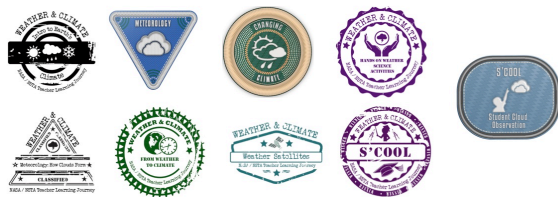
Figure 3. Case study participant Sally’s stamps and badges.

Third, at the most fine-grained level, we sought to elucidate learners’ complex interactions with the badges, stamps, and the badging system within TLJ. To conduct this in-depth analysis, two teachers were selected — one as an example of average engagement in TLJ and the other as an example of high-level engagement in TLJ. These two teachers were strategically sampled as the typical user and the extreme user. The first participant, Barbara, received a total number of stamps and badges similar to the year one average. The second participant, Sally, completed more than double the average teacher. In this way, our examination includes both a typical learner (Barbara) and a heavily involved learner (Sally, see Figure 3). Both Barbara and Sally agreed to participate in year one as part of their summer professional learning and expressed enthusiasm when getting started. They were selected in order to focus on two people with similar backgrounds, yet they experienced different learning journeys given their interests, expertise, and personal goals as described in Section 4.4.