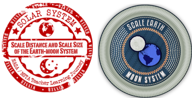
Figure 2. A TLJ stamp (left) and a TLJ badge (right).

To illustrate the difference between badges and stamps, the PD badging activity, Scale Models: The Earth-Moon System in the Solar System is a good example. This Scale Models activity has three options for teachers: (1) the entry-level activity is earning a TLJ stamp (Figure 2 left); teachers attend the webinar and write one brief reflective post, (2) a higher level of mastery means earning a TLJ badge (Figure 2 right), teachers also attend the webinar but they write a full lesson plan on incorporating the content into classroom activity, or (3), teachers can earn both the TLJ stamp and badge for this Scale Models activity by meeting both the stamp and badge criteria. To make the stamp and badges visually distinct, the stamp was given a design akin to a passport office rubber stamp and the badge an embroidered patch as shown in Figure 2.