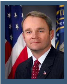
J. M. McConnell Director of National Intelligence

A handwritten signature in blue ink that reads "J M McConnell".